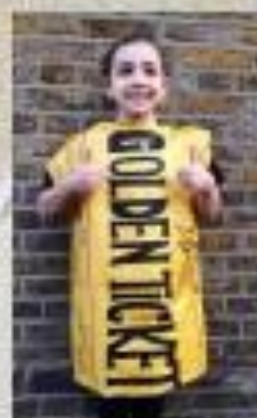
Charlie & Chocolate Factory